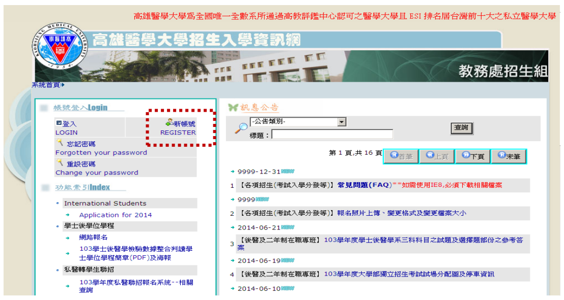
Step 2 : Click 'Append' → Fill in your information → Click 'Save'